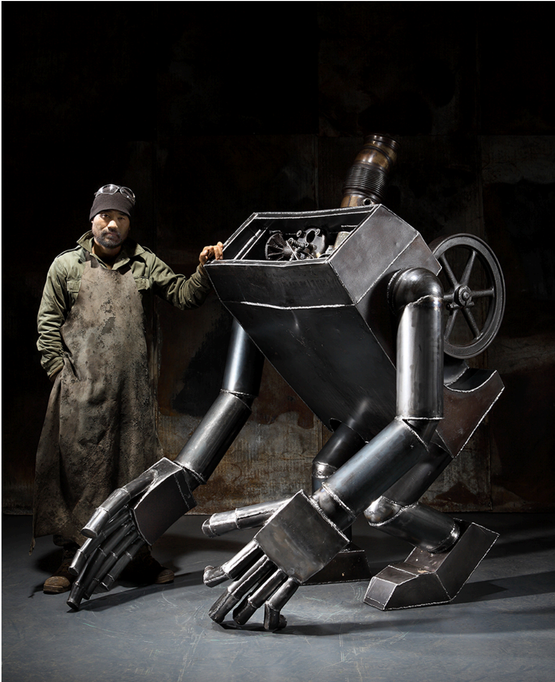
© Steel Che (Youngkwan Choi) with 'Steam Robot'. Carbon steel, 47 x 47 x 71 inches.

Art in Dongsan's presentation of Steel Che at the LA Art Show 2025 offers visitors a unique opportunity to experience the intersection of industrial heritage and contemporary sculpture, showcasing the evolving landscape of Korean art.