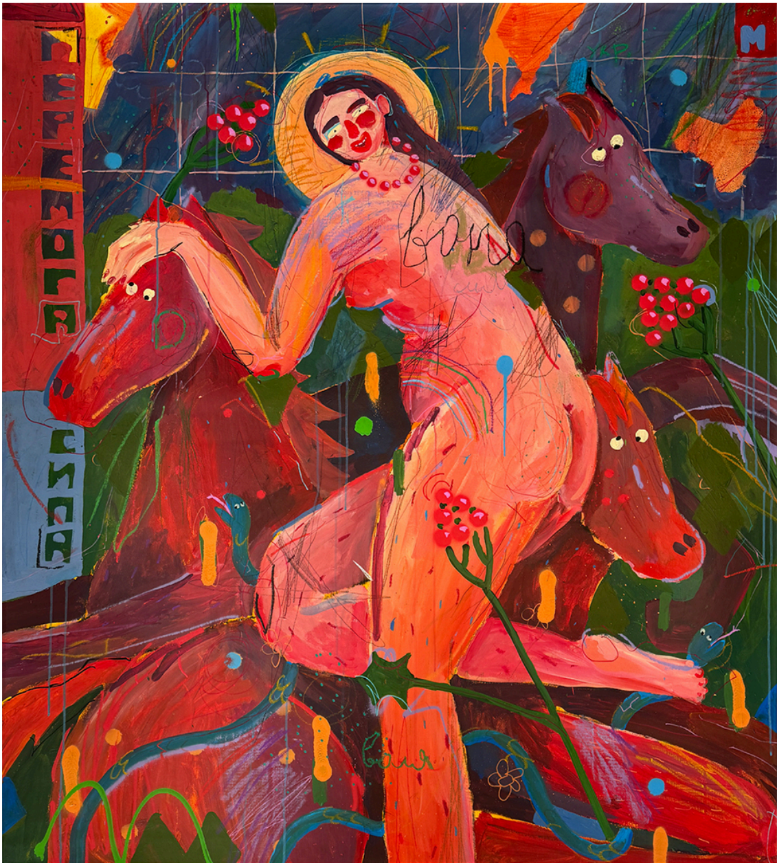
© Iryna Maksymova, Caring For Each Other , 2022. Acrylic, Pastels, Spray, Markers on Canvas, 53 1/8 x 59 7/8 inches (135 x 152 cm).