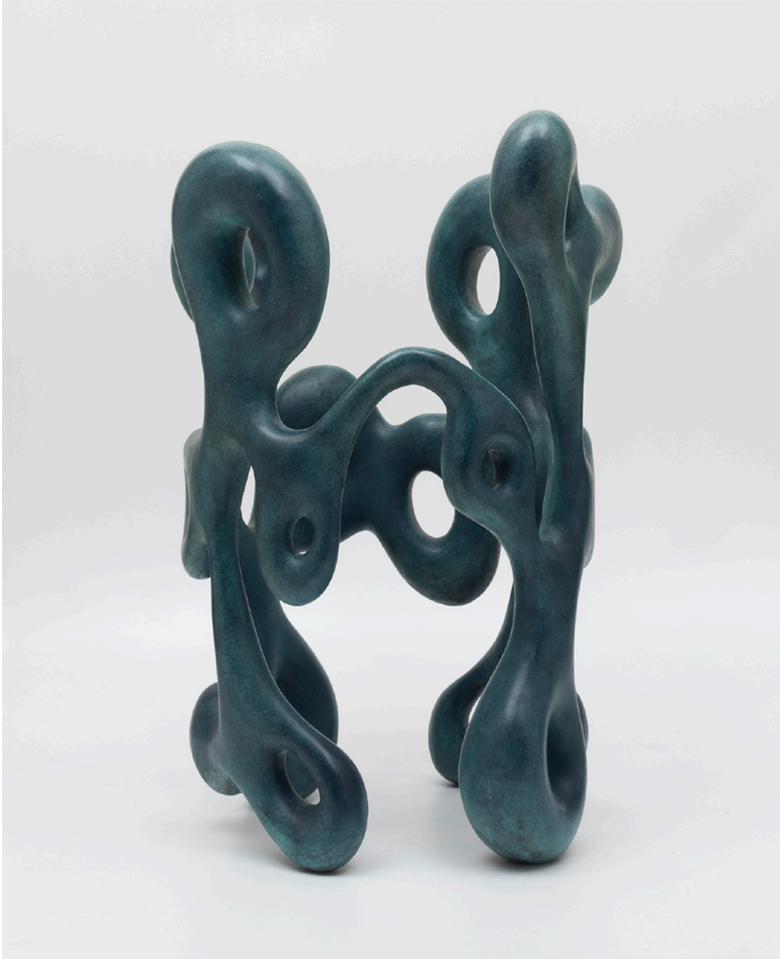
© Roberto Vivo. The Human Tribe Totem . Bronze Sculpture, 77 X 95 inches.

Coral Gallery's presentation of Roberto Vivo at the LA Art Show 2025 offers visitors an opportunity to engage with contemporary Latin American sculpture that addresses themes of human connection and global understanding.