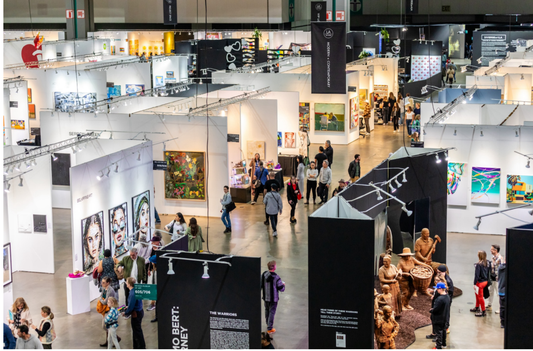
The LA Art Fair's 2024 edition.

What began in 1994 with just 14 galleries at the Pasadena Convention Center has blossomed into one of the West Coast's premier art fairs, attracting international creators and collectors alike. As the LA Art Show celebrates its 30th anniversary, its sister fair Art Palm Beach returns for its third year.