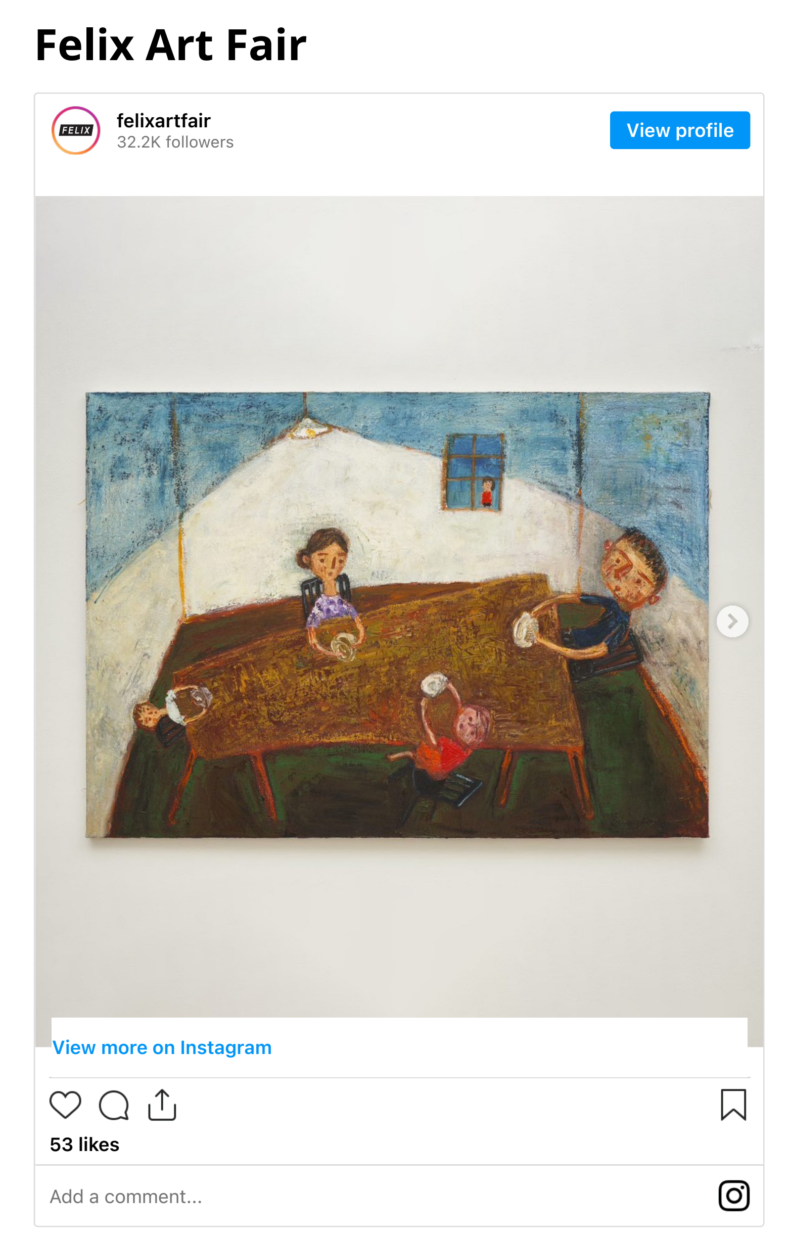
Felix Art Fair will transform the Hollywood Roosevelt into an art epicenter from Feb. 19 to 23. Highlighting

The end of February ushers in a celebration of art across the city. From the highly anticipated Freize Los Angeles to independent art fairs and more, here is what to do during Los Angeles Art Week.